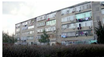
One of many apartment blocks built during the Soviet occupation

provided by government schools. Asked about the Soviet aid program, president Karzai told the Washington Post: "The Soviet money went to the right place. They were efficient in spending their money and doing it through the Afghan government."