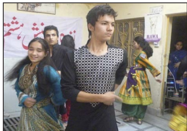
Photos from RAWA's Annual Report for Hewad High School, 2013.

November 2014: Annual SAWA-NSW Lunch date to be notified.