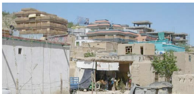
New luxurious villas, often built on land taken from the poor, rise above homes of destitute people. ( ifpo.hypotheses.org/4232 )

The USA gave more than $100 billion of non-military aid. Officially given to be spent on roads, schools and hospitals, most of it disappeared into the pockets of corrupt warlords and businessmen. The major legacy of American dollars is a building boom of private palaces right next to the ramshackle dwellings of the poor and often built on land taken from which poor families were evicted.