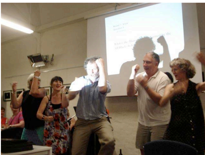
The haka, nearly as menacing as the New Zealand All Blacks!