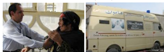
A doctor treats a patient (left); the clinic ambulance (right)