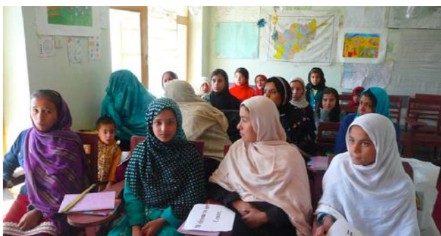
Students of the literacy class; the imam's wife covered herself fully before I entered the classroom.

The Centre continues to receive the highest praise from the Ministry of Education, who says that unlike other NGOs that promise many things but do not deliver, the Vocational Training Centre operates a most successful program.