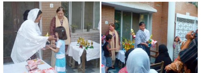
Some photos from the graduation ceremony of May 2011