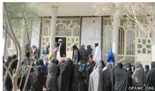
Patients wait in front of Hamoon Clinic during a visit of OPAWC director Latifa Ahmady in April 2011

Support for the Vocational Training Centre and the Hamoon Clinic is administered by SAWA (SA). Please consider a donation in support of the school. Bank account details for SAWA-Australia (SA) can be found on page 3.