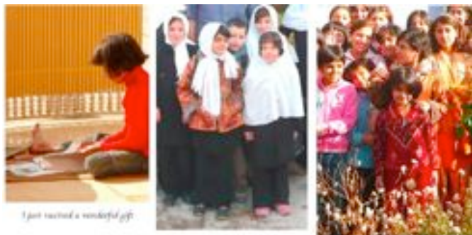
Hewad card 1

For several years SAWA offered personalized gift cards with a photo of Naseema Shaheed High School. The school was closed by the government of Pakistan in 2007, so it is time to replace it with new cards. There is now a choice of three cards in support of Hewad High School and two cards in support of the Vocational Training Centre. The cards can be ordered online at www.sawa-australia.org/products.html or by mail. Please visit the web page to find out details or request information by post if you cannot access the internet.