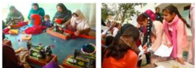
Training Centre card 1